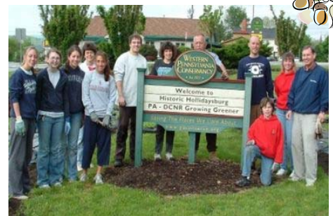
VOLUNTEERS AT THE GATEWAY GARDEN NEAR THE DREAM.