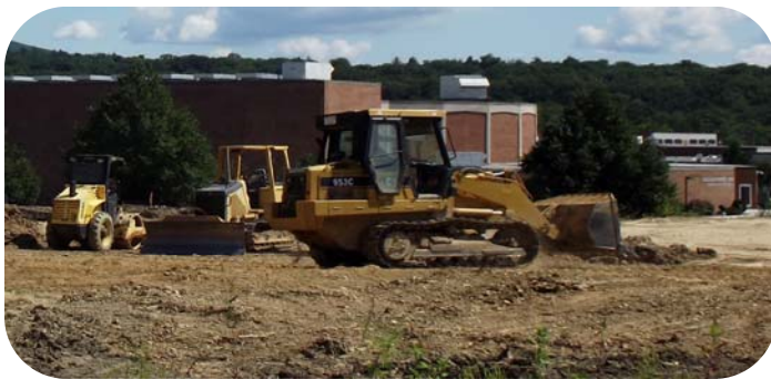
A recent view of the new Hollidaysburg Area Public Library's construction site. The new building is scheduled to be completed in Spring 2014.

Mon - Thurs - 9:30 AM - 8 PM Fri - Sat - 9:30 AM - 5 PM Sun - Closed